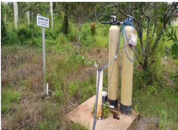
Fig. 2: Drilling Well Located on Agricultural Land

Meanwhile, the procurement of drilled wells will directly affect them. Drilled wells can be used to irrigate agricultural land and, at the same time, extinguish fires when fires occur. Another way is to provide abandoned land to be managed by the community so that people are responsible when a fire occurs.