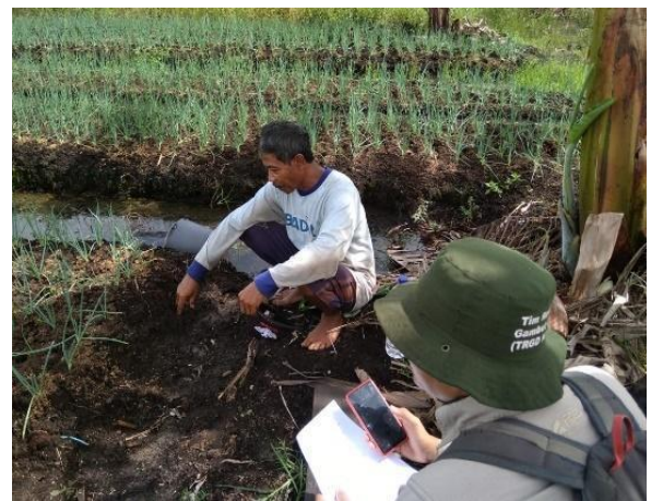
Fig. 3: Peatlands Managed by Communities

The form of mitigation is carried out by the community before a fire occurs by protecting the land, especially the land they manage. People have an economic interest in the ground because the land is their source of livelihood. The community is very concerned about keeping the land from burning further. They have bore wells that will be used when there is a fire. Burning the land to prepare the ground was carried out to ensure that the fires did not spread. Economic re-vitalization by utilizing land that is prone to burning to land productive turns out to be far more effective in reducing land fires in this region than merely calling for a ban on burning land (Figure 3).